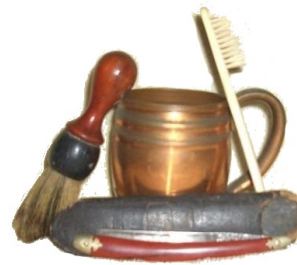
SHAVING KIT AND TOOTHBRUSH