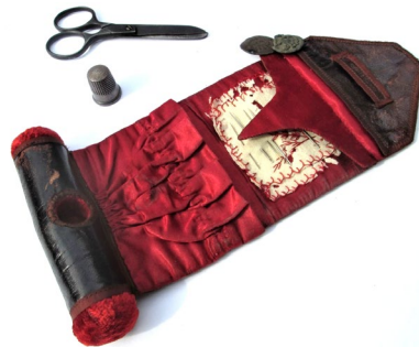
"HOUSEWIFE" SEWING KIT